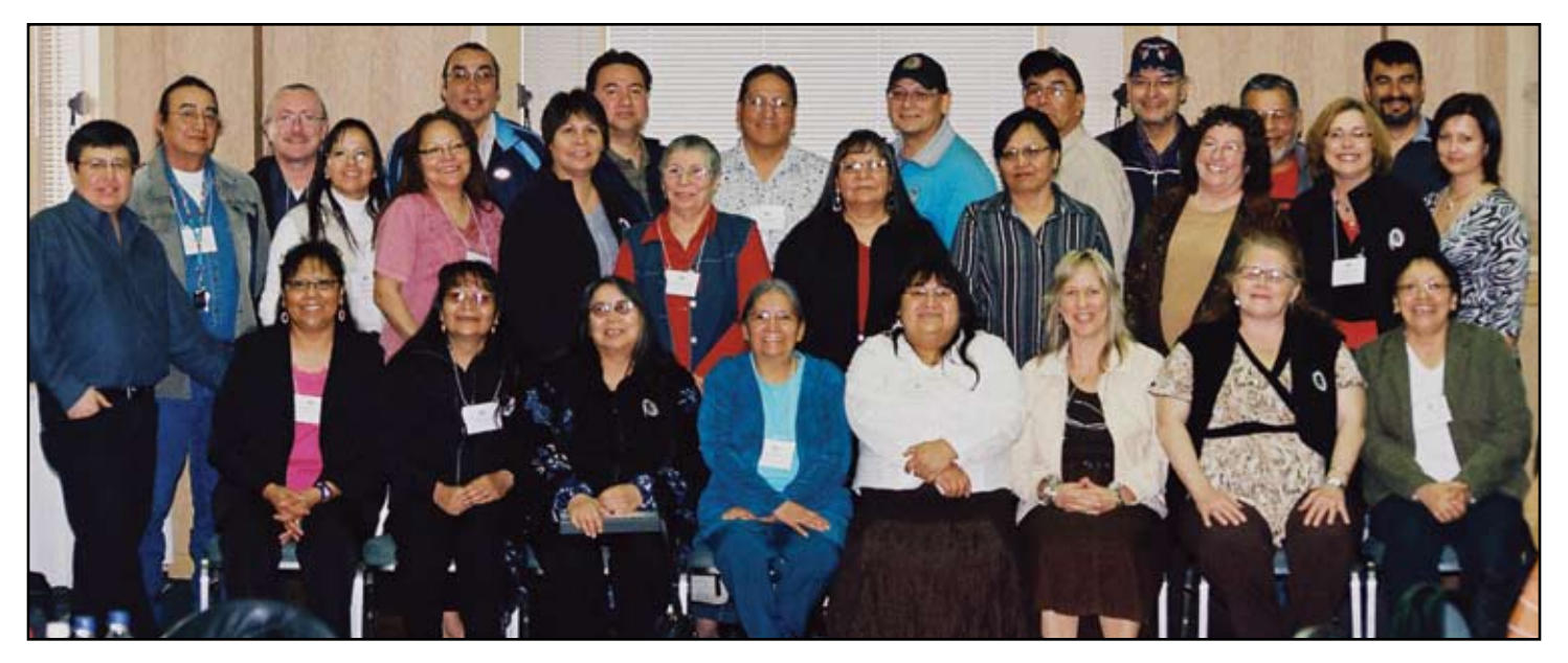
Photo (above): Aboriginal Healing Foundation staff pictured at a recent Project Gathering Workshop