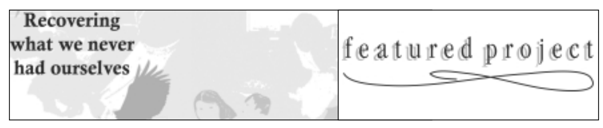
'Circle of Life' Traditional Family Mental Health, Battleford Tribal Council, Indian Child and Family Services.

When I hear people say "We've lost this, we've lost that," I do not believe that. We have not lost anything: we have just forgotten; we are coming out of a big sleep. We are waking up, and it's a beautiful thing, to wake up and see we are alive, we are still here."